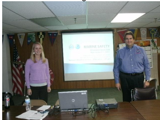
National Weather Service Guest Speakers