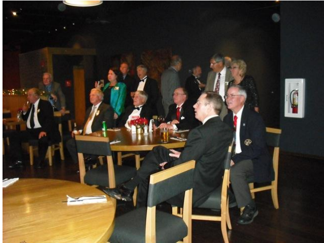
Party-goers take time out to watch the Badgers win the football game. Rose Bowl, here we come!