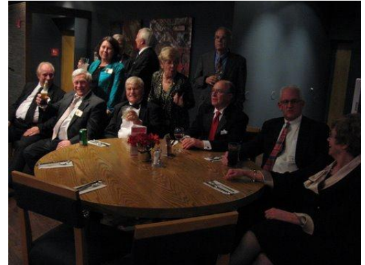
All dressed-up and watching Wisconsin beat Michigan State for the right to play in the Rose Bowl!