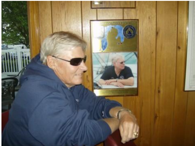
Our very own celebrity!