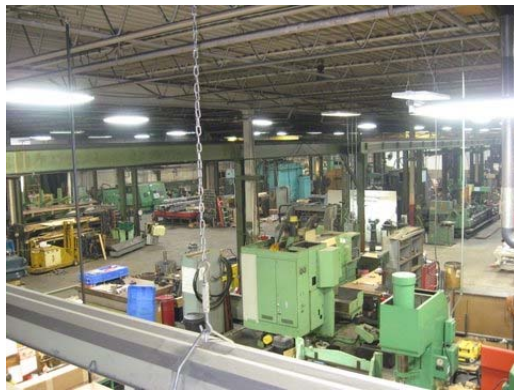
Overview of Manufacturing plant