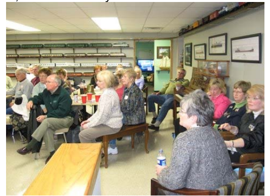
MBC meeting at Zierden Corp. Notice the train collection in background