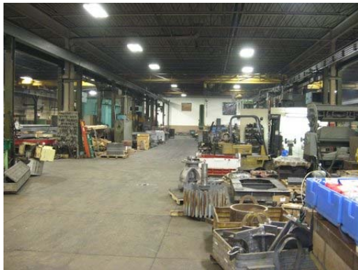
Zierden Company - Manufacturing Plant