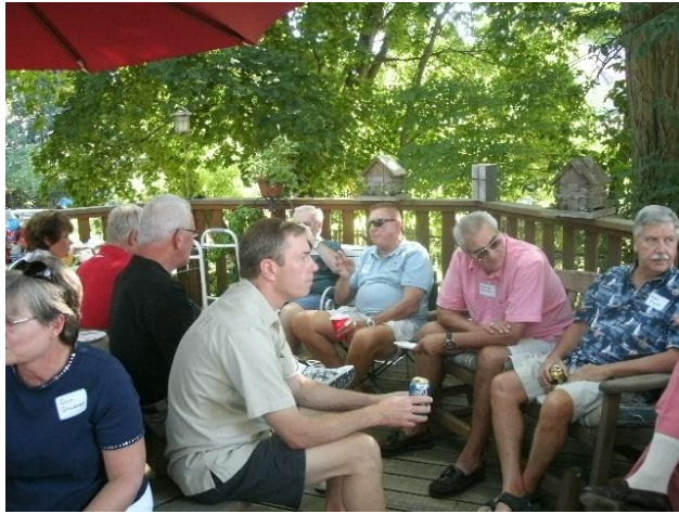
Relaxing on the deck with friends