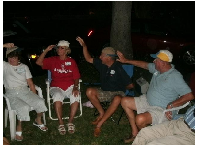
The famous hat game