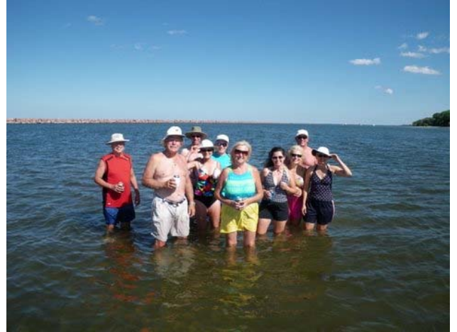
MBC'ers standing on Texas Rock