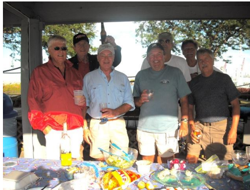
At the potluck dinner