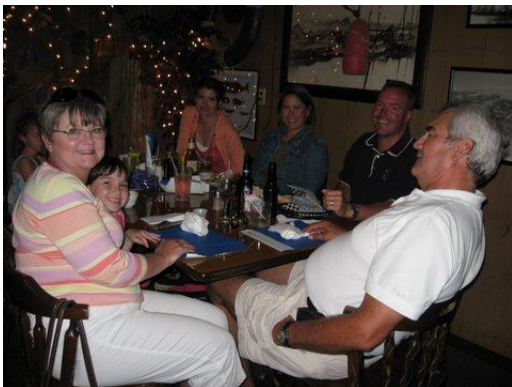
Graubners and Woods families