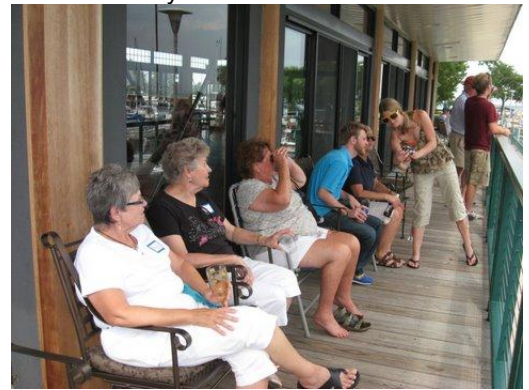
Watching the Air Show