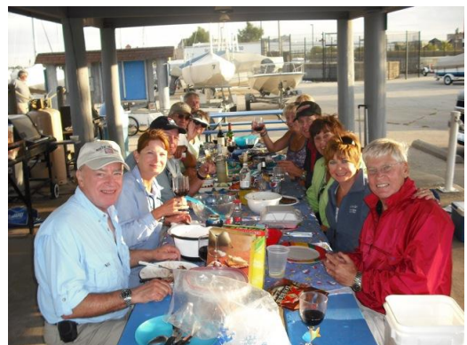
MBC members may have had to spend an extra night at Racine, but that didn't prevent a good time at our potluck dinner!