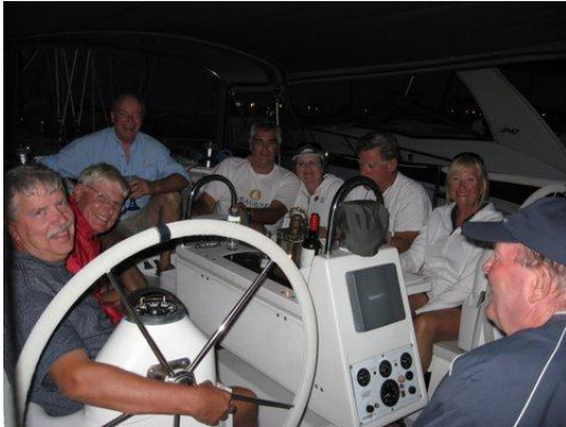
Enjoying time with friends