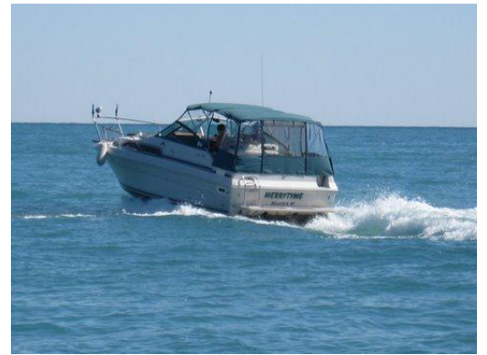
"Merrytyme" on the way back to Milwaukee